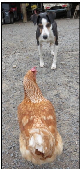
Caption Please ? Send to Sonia ,8444834